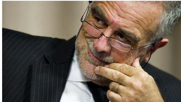
Luis Moreno Ocampo gave information to a possible war-crimes suspect

October 1 2017, 12:01am, The Sunday Times