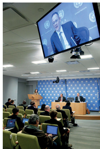
Press conference by Ben Emmerson (at table, right, and on screen), Special Rapporteur on the promotion and protection of human rights while countering terrorism and Christof Heyns (at table, left), UN Special Rapporteur on extrajudicial, summary or arbitrary executions at UN Headquarters in New York.

OHCHR's expertise, guidance materials and experience have proven to be instrumental in promoting the inclusion of economic, social and cultural rights in the public agenda and mobilizing an array of different actors and stakeholders with a view to affording better legal and judicial protection of these rights.