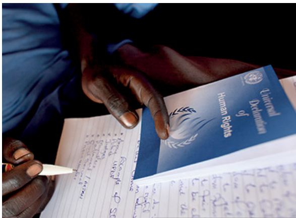
Human rights training of security forces in Uganda. A sound understanding of human rights standards among law enforcement officials is essential for access to justice.

Recent events around the world have provided stark reminders of how an absence of the rule of law leads to violations of civil, political, economic, social and cultural rights, as well as to oppressive rule and conflict. As a result, Member States came together at a General Assembly high-level meeting in September 2012 and reaffirmed their commitment to the rule of law, as well as the interlinked and mutually reinforcing nature of the rule of law and human rights, by adopting the Declaration on the Rule of Law at the National and International Levels. They further committed themselves to ensuring accountability for international crimes and other gross violations of human rights and supporting the establishment of transitional justice mechanisms.