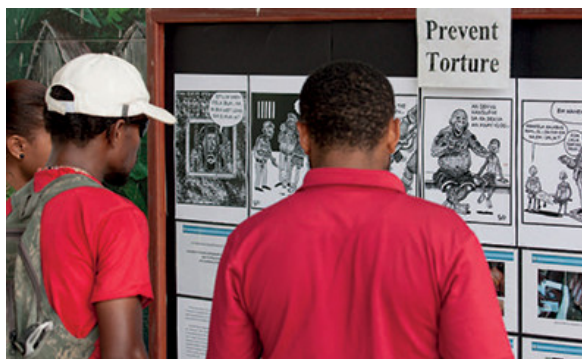
Participants look at an exhibition on torture organized by OHCHR in Papua New Guinea.

OHCHR manages direct assistance provided to victims of torture through the Voluntary Fund established by the General Assembly and supports the preventive activities of the Subcommittee on Prevention of Torture as well as the implementation of the recommendations of the Committee against Torture and the Special Rapporteur on torture. Based on the relevant international normative framework and OHCHR's well-established experience in monitoring, reporting, advocacy and technical assistance, the Office has developed tools to assist Member States in combating torture and other forms of ill-treatment and strengthen protection of the rights of persons deprived of their liberty in line with international norms and standards.