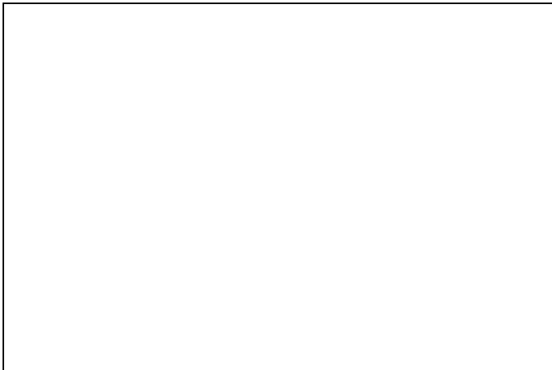
Figure 1 Luanda

The Angolan Constitution contains provisions for the protection of human rights and Angola is a party to the African Charter on Human and Peoples' Rights, the International Covenant on Civil and Political Rights and other human rights treaties. However, there has been a failure of political will to ensure that these constitutional and treaty provisions are incorporated into national law and applied in practice.