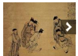
Culture insider: China, birthplace of football