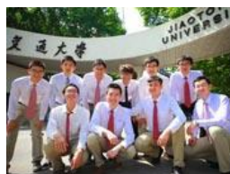
Graduation photos of students with Xi'an Jiaotong University hit the Internet