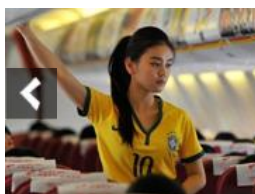
Stewardesses in Brazilian soccer jerseys