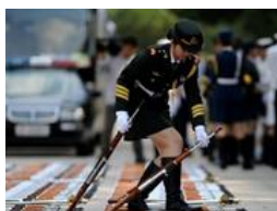
Training details of female PLA honor guards unveiled