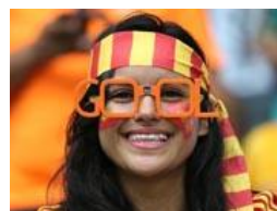
Beauties in World Cup