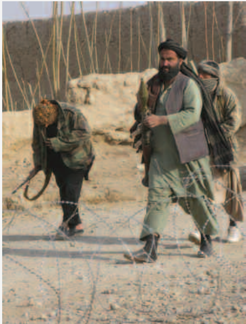
(above) Arbakai working with Afghan and ISAF forces, patrolling Gultepa area in Kunduz, January 2011.

Against this backdrop, we then provide an account of the ALP one year after it was created, detailing instances in which local groups are again being armed without adequate oversight or accountability. We conclude that unless urgent steps are taken to prevent ALP units from engaging in abusive and predatory behavior, the ALP could exacerbate the same perverse dynamics that subverted previous efforts to use civilian defense forces to advance security and public order.