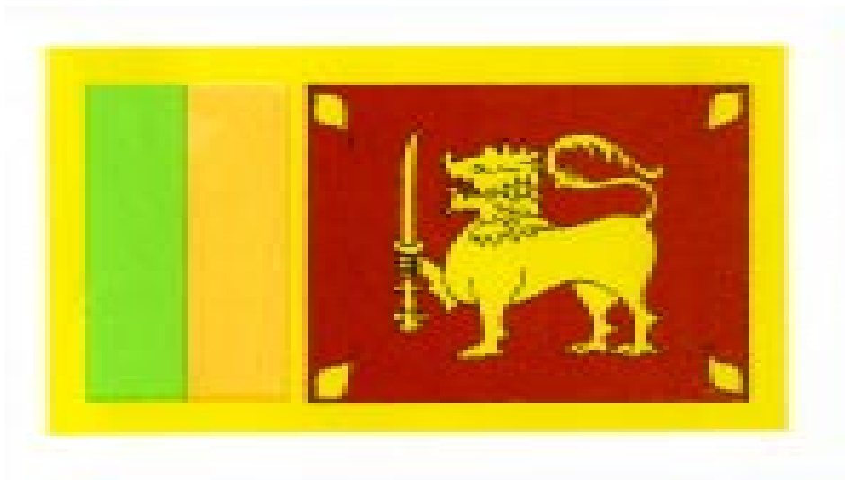
The National Flag