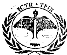
[Seal of the Tribunal]

Done this 22 nd day of February 2012, at The Hague, The Netherlands.