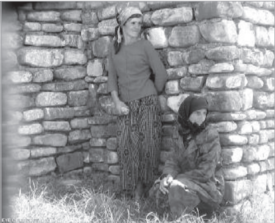
Chechens do not feel safe in Pankisi