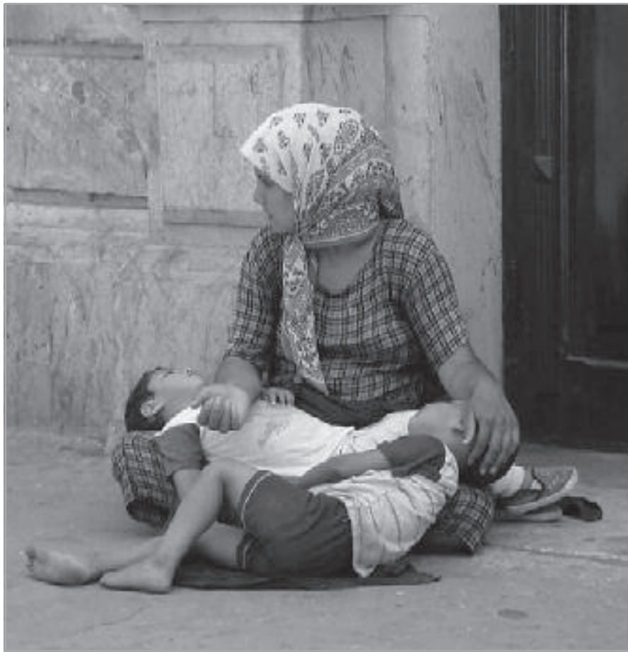
Early marriages are more common than legal ones in Azerbaijan