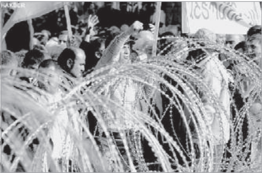
Confrontation at the President's administration building in Yerevan