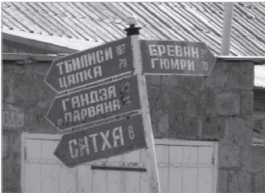
Intersection in Ninotsminda