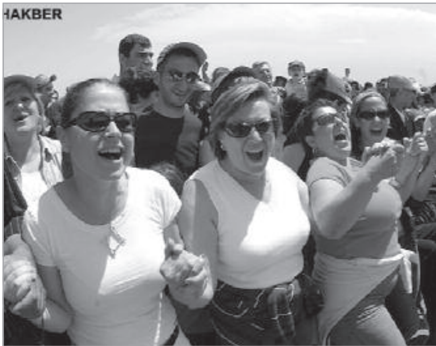
Round Dance of Unity at the foot of Mt. Aragats