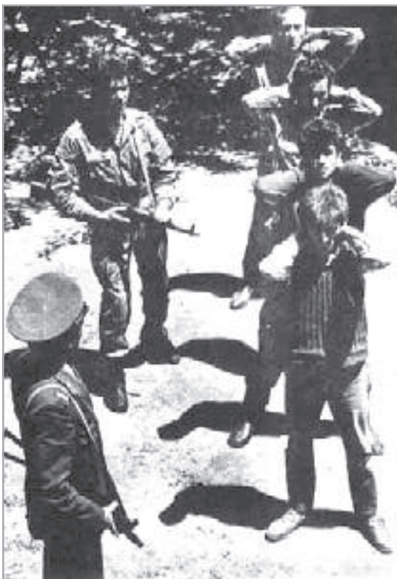
An amateur picture made at the beginning of the war in Karabakh. It is not clear who has captured whom