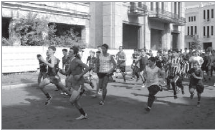
Youth cross-country race in Sukhum