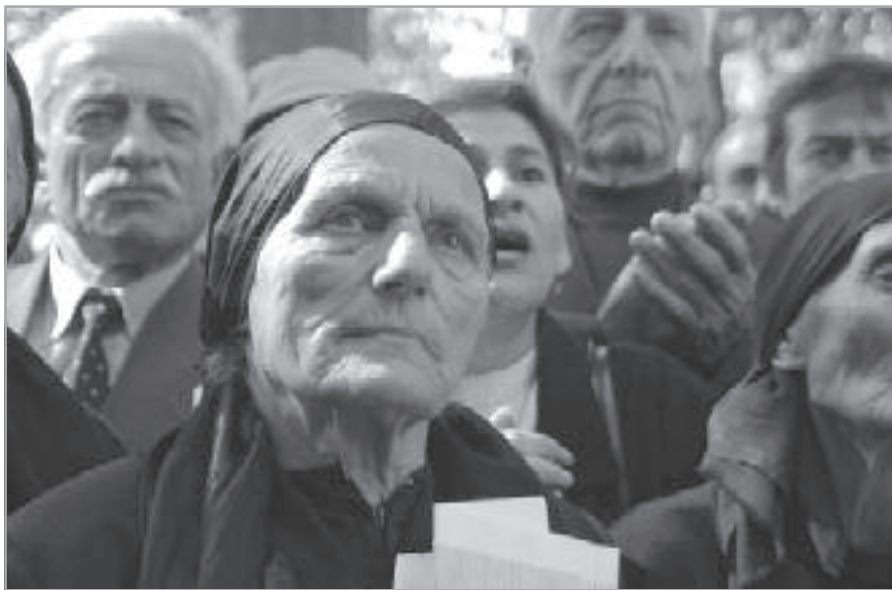
Hot autumn weather in Abkhazia